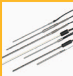
Calibrated Temperature Sensors

A wide array of accessories is available to help you maximize productivity, but the following are essential for most users.