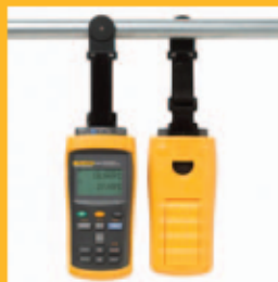
TPAK Magnetic Hanger