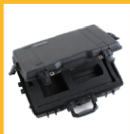
Probe and Readout Case