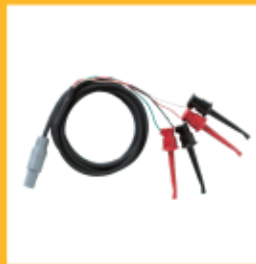
Universal RTD Adapter