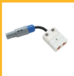
Universal Thermocouple Adapter