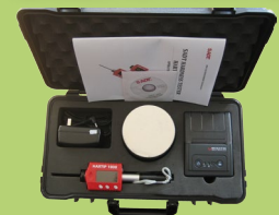
Standard package - HARTIP1800