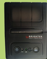
Mirco Printer for HARTIP3000/HARTIP2000