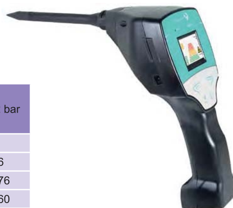
LD 400 with focus tube and focus tip for precise locating